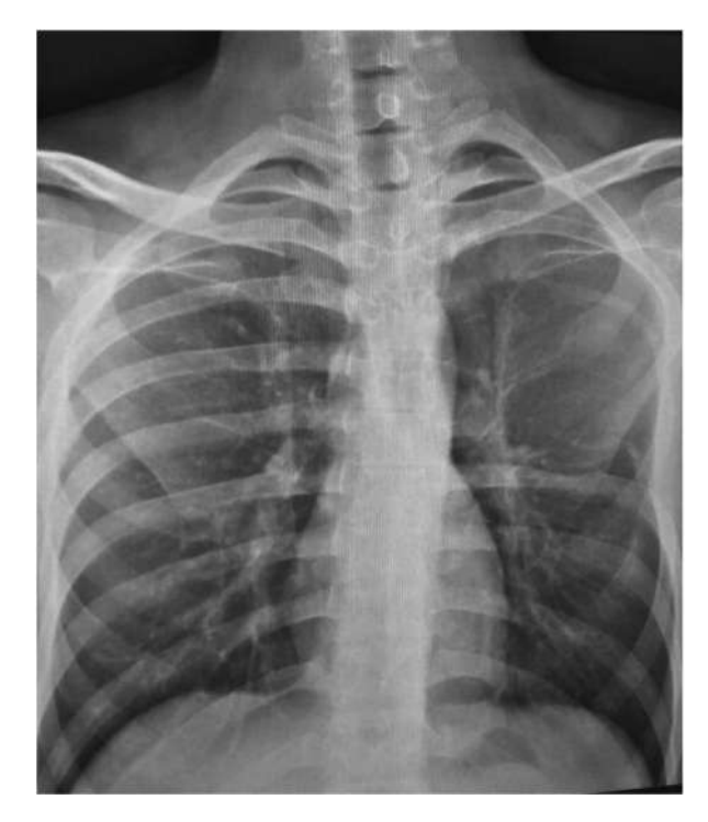
Fig. 1. Chest x-ray showed that the fourth to sixth ribs were missing in the left hemithorax.

Herein, we present the case of an adult man who presented with the symptomatology and clinical features of VBD, the diagnosis in this case being made after excluding other secondary causes of osteolysis. VBD is a rare bone disease of uncertain etiology and is characterized by extensive monostotic or polyostotic spontaneous bone resorption. Exact figures on the incidence and prevalence of this condition are hitherto unknown. It is characterized by the proliferation of lymphatic and vascular channels that results in massive osteolysis of the involved bones, and histopathology reveals the presence of fibrous tissue with blood vessels, with the marrow replaced with fibrovascular tissue or abundant vascular