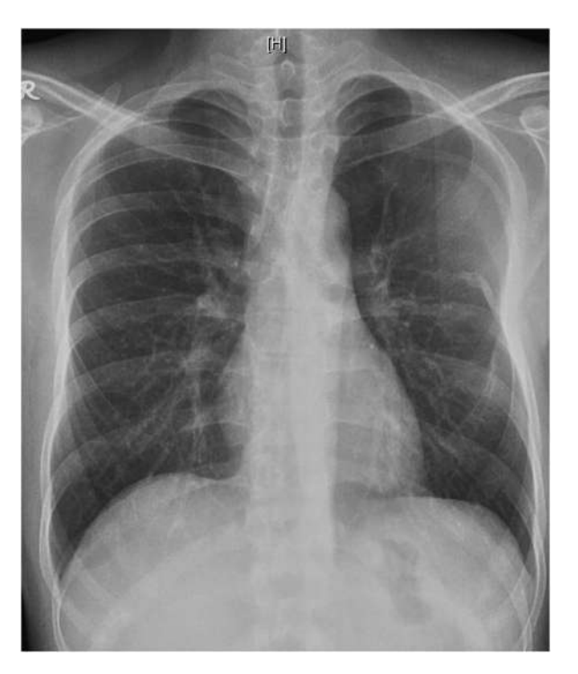
Fig. 3. Chest x-ray showed no radiographic progression of the disease.

presented with dyspnea and recurrent episodes of pleural effusion following a blunt trauma of the chest who was later diagnosed to have VBD with massive osteolysis of the ribs. He required treatment with local radiotherapy with monthly infusions of pamidronate with thalidomide. His condition remained stable after 7 years of medical therapy with mild pleural thickening and fibrosis.<sup>14</sup>