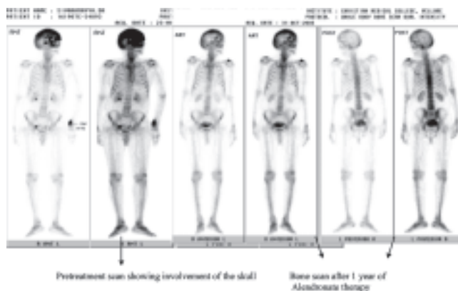
Fig. 3 : Pretreatment and posttreatment bone scans.