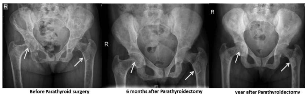
Figure 1 Serial X-rays of the pelvis showing improvement following parathyroidectomy in osteitis fibrosa cystica.

To cite: Sathyakumar S, Cherian KE, Shetty S, et al. BMJ Case Rep Published online: [please include Day Month Year] doi:10.1136/bcr-2016-214970