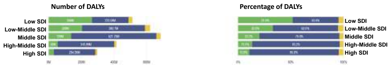
Fig. 2 | All-age number and percentage of Dalys by socio-demographic Index using the care needs classification. All-age number and percentage of disability-adjusted life years (DALYs) for 293 conditions classified according to their care

needs classification (i.e., acute [green], chronic [blue], and undetermined [yellow]) by Socio-Demographic Index (SDI).