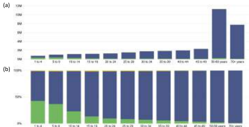
Fig. 3 | Number and percentage of YLDs for both sexes by age group using the care needs classification for sequelae. Number (a) and percentage (b) of global years lived with disability (YLDs) according to the care needs classification (i.e.: acute [green], chronic [blue], and undetermined [yellow]) by age group.

needs classification (i.e., acute [green], chronic [blue], and undetermined [yellow]) by Socio-Demographic Index (SDI).