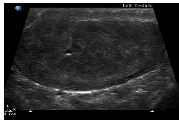
Figure 1: Ultrasound of the left testicle showing hyperechoic areas.