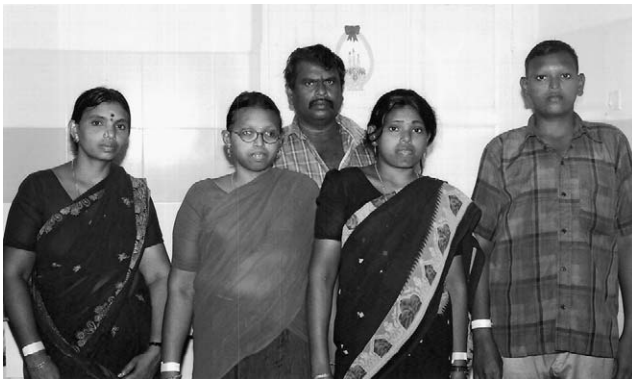
The family with three affected siblings and the parents. From left: mother, proband, father (at back), sister with wig and brother.

diabetes mellitus, very sparse scalp hair, eyebrows, mild mental retardation, mild sensorineural hearing loss and variations in the ST-T portions of the ECG. The proband in our family has all these features.