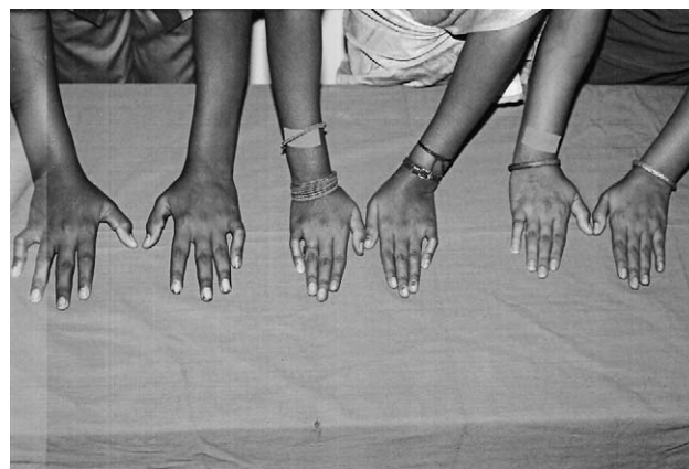
Photo shows large hands of the affected siblings. Note the deformity of the fingers, most prominent in the fifth finger.